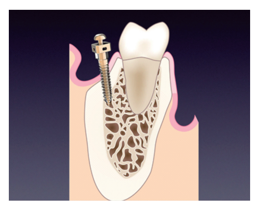
Figure 2 - BS screw.